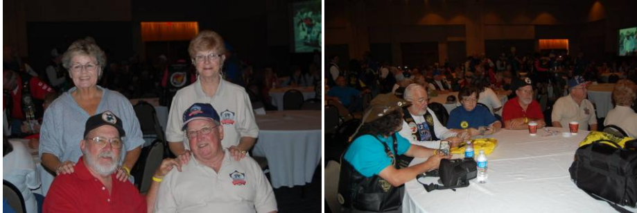
Some nice folks and friends enjoying Wing Ding